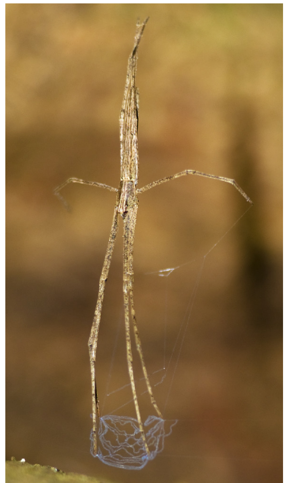
FIGURE 1. Deinopis amica and its web.

millimeters): females (N=7): total length: 15.55 \pm 2.65 ; carapace length: 4.15 \pm 0.45 ; carapace width: 2.60 \pm 0.30 ; males (N=3): total length: 13.80 \pm 1.00 ; carapace length: 3.95 \pm 0.05 ; carapace width: 2.50. We deposited voucher specimens in the arachnological collection of Facultad de Ciencias Universidad de la Republica (FCE), Uruguay.