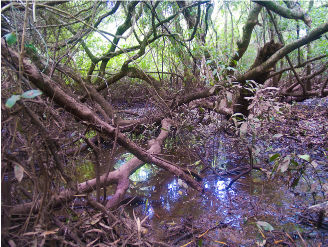
FIGURE 2. Riparian forest in Caballada Island at Uruguay River.

Specimens examined: Uruguay. Río Negro. Caballada Island: 26/03/2008, 1♀, A. Laborda, (FCE 5711); 23/03/2009, 1♀, A. Laborda, (FCE 5712); 26/03/2009, 1♀, A. Laborda, (FCE 5713); 19/12/2007, 1♀, A. Laborda, (FCE 5714); 26/03/2008, 2♀, G. Useta, (FCE 5715); 26/03/2008, 1♀, F. Pérez-Miles, (FCE 5716); 29/09/2007, 1♂, A. Laborda, (FCE 5717); 15/12/2008, 1♂, A. Laborda, (FCE 5718); 15/12/2008, 1♂, F. Pérez-Miles, (FCE 5719); 25/06/2008, 1J, A. Laborda, (FCE 5720); 25/06/2008, 1J, G. Useta, (FCE 5721); 25/06/2008, 1J, G. Useta, (FCE 5722); 24/09/2007, 1J, L. Montes de Oca, (FCE 5723); 19/12/2007, 1J, F. Pérez-Miles, (FCE 5726); 02/10/2008, 2J, A. Laborda, (FCE 5727); 25/06/2008, 2J, G. Useta, (FCE 5728); 25/06/2008, 1J, G. Useta, (FCE 5729); 15/12/2008, 1J, A. Laborda, (FCE 5730); 25/06/2008, 1J, L. Montes de Oca, (FCE 5731); 15/12/2008, 1J, L. Montes de Oca, (FCE 5732); 25/06/2008, 1J, G. Useta, (FCE 5734); 08/10/2009, 1J, F. Costa, (FCE 5737); 25/06/2008, 1J, F. Pérez-Miles, (FCE5738). Prefectura Naval: 16/12/2008, 1J, G. Useta, (FCE 5724); 26/06/2008, 1J, A. Laborda, (FCE 5725); 16/12/2008, 1J, A. Laborda, (FCE 5733); 16/12/2008, 1J, L. Montes de Oca, (FCE 5735); 16/12/2008, 1J, F. Pérez-Miles, (FCE 5736).